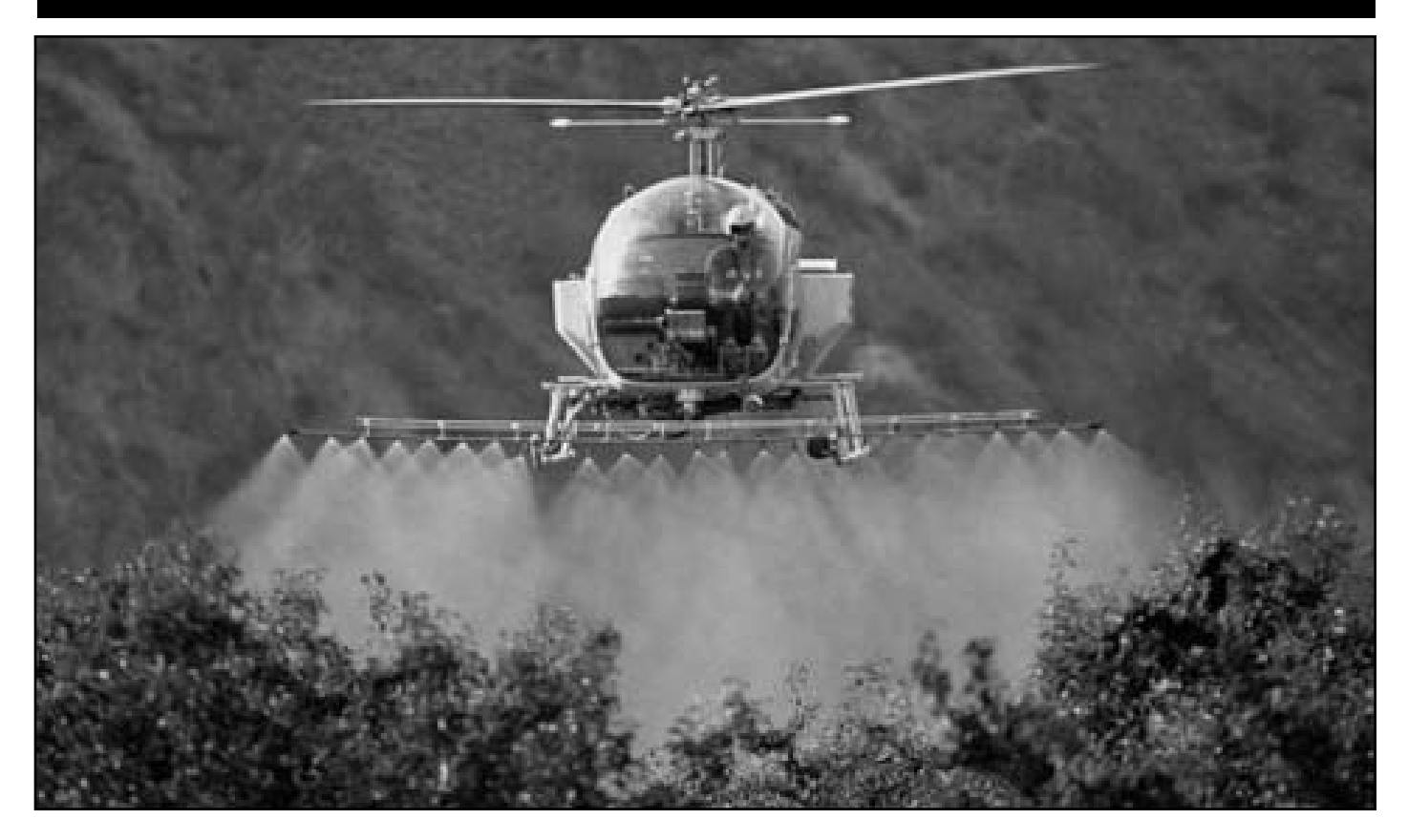
Oregon Residents Challenge the State's "Right to Farm Law" "Right to Farm Law" Allows Heavy Aerial Pesticide Applications

Grocery Goliaths Takeover the Supermarkets - pg. 4 Annie's Sells out to General Mills - pg. 5 Black Farming and Land Loss - pgs.6 & 7 The Food Sovereignty Award - The Real "Food for People" Prize - pgs. 10&11 Citizens Shouldn't have to Force DNR to Enforce Water Laws - pgs.12&13 NYC Peoples' March and Convergence - pgs. 14 &15