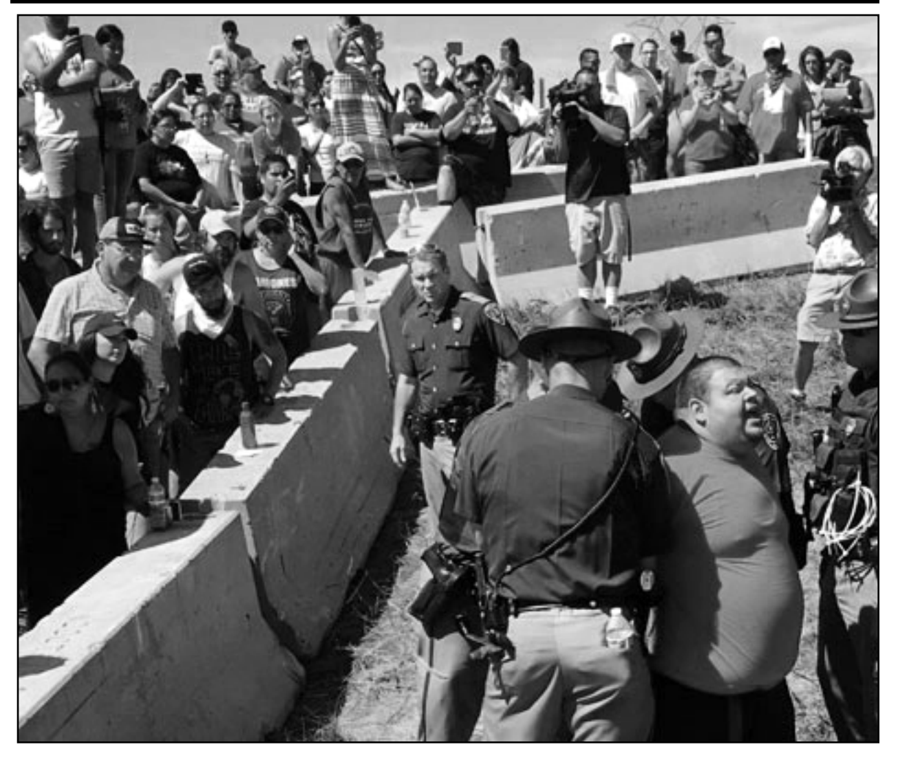
Opposition to the Dakota Access Pipeline