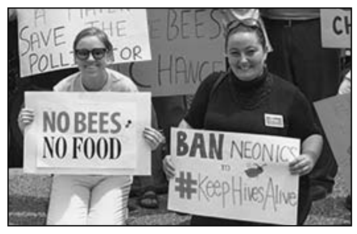
EcoWatch Photo Credit - Suzannah Hoover

Farmers, beekeepers and food advocates met with officials from the EPA, members of Congressand representatives from the U.S. Department of Agriculture, delivering letters from nearly 200 businesses and organizations urging action on bee-killing pesticides and support for sustainable agriculture, as well as 4 million signatures from concerned citizens.